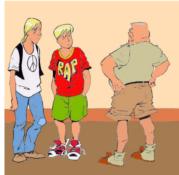
Retired army major

Major: Monty, Alexander, I gave you conquerors' names so that you would take up military careers! Just like me! Field Marshal Major was my rank and I am proud of it. To serve one's country as a soldier is more than just a job, my boys. You are a soldier and you work in your specific domain. Monty, you want to be a mechanic, it appears? Good! You will be a mechanic in the army! What about you, Alexander? Sports? Very good! And bear in mind there are over 400 jobs in the Army. You still have a choice!